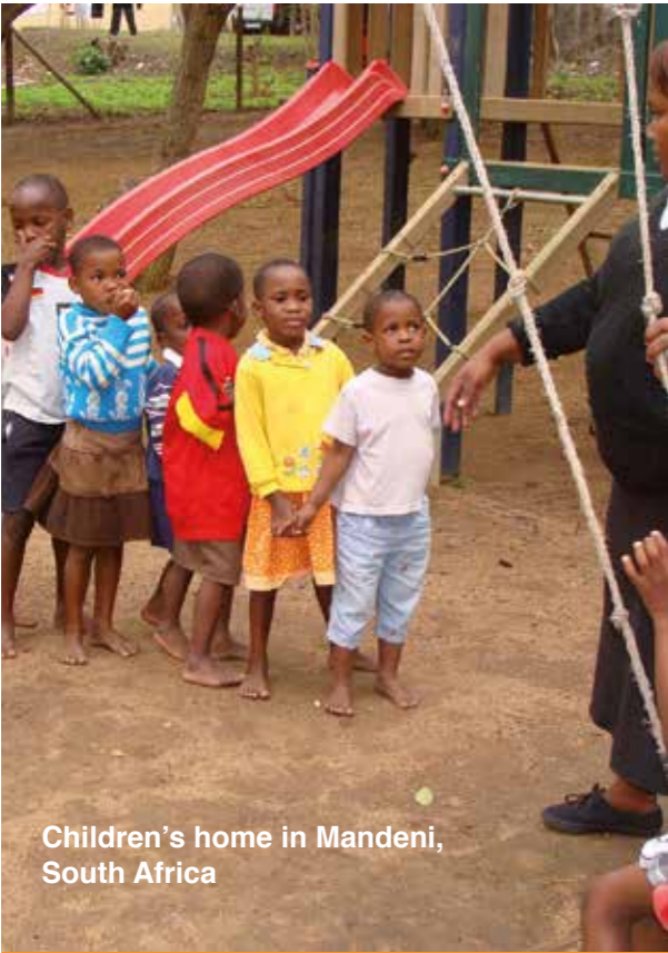
Children's home in Mandeni, South Africa