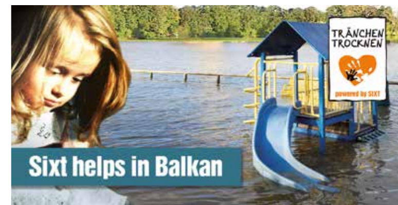
More than ten Sixt vans gradually set off from Munich, Rostock, Vienna, Frankfurt, and other German cities to bring relief supplies to the affected regions.