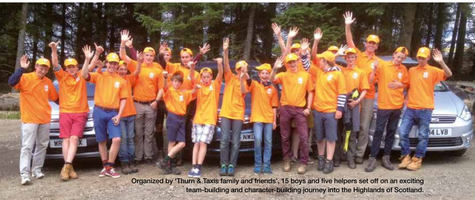
Organized by 'Thurn & Taxis family and friends', 15 boys and five helpers set off on an exciting team-building and character-building journey into the Highlands of Scotland.

youngsters were given awards in recognition of the values they had experienced during their time. The whole organizational team and the group of travellers were very happy and grateful for the help they were given by Drying Little Tears, and photographs were taken of the children wearing Drying Little Tears shirts and caps.