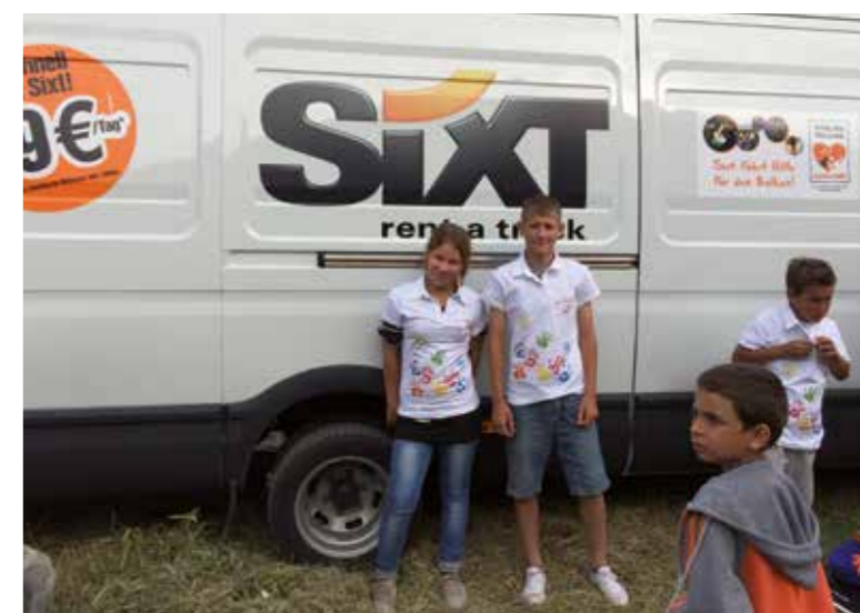
They drove to Doboj in Bosnia-Herzegovina, to the Croatian village of Gunja, and to Red Cross collecting stations at Bijeljina (Bosnia-Herzegovina) and Novi Sad in Serbia.