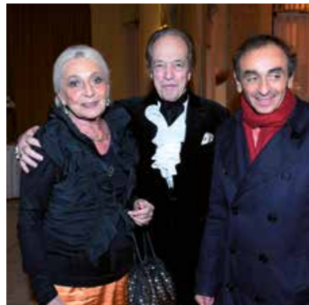
Participants of the Charity Gala in Paris S.A.R la Comtesse de Paris, Monseigneur le Comte de Paris and Éric Zemmour (l. to r.)