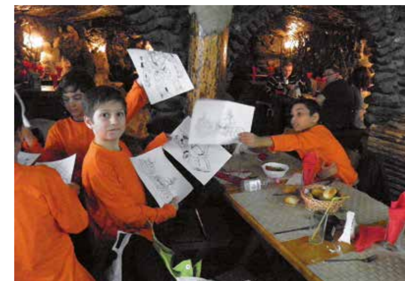
The House of St. John: Although such a facility for children can never replace a family in the traditional sense, the personnel can provide the necessary support and attempts to be a "home".

The House of St. John offers support, a safe and secure environment and family care to children from a state program for the protection of children. The children are provided with care and protection until it is possible for them to return to their families or have an opportunity to be integrated in an adoptive or foster family. Although such a facility for children can never replace a family in the traditional sense, the personnel can provide the necessary support and attempts to be a "home". The residential center operated by the local branch of Caritas is in urgent need of new furniture for the children's room, a therapy room, and the living room. The purchase of new furniture has now been made possible thanks to approved funding by the Regine Sixt Children's Aid Foundation.