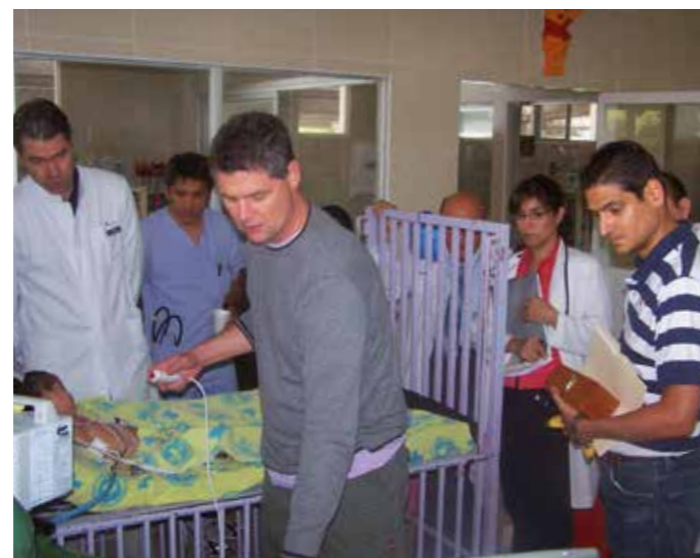
The birth rate in El Salvador is very high compared with Germany (14 times higher). This means that despite a relatively small population of around seven million, several hundred children are born in El