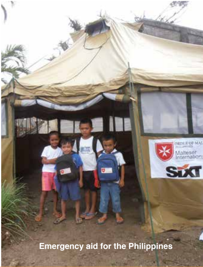
Emergency aid for the Philippines