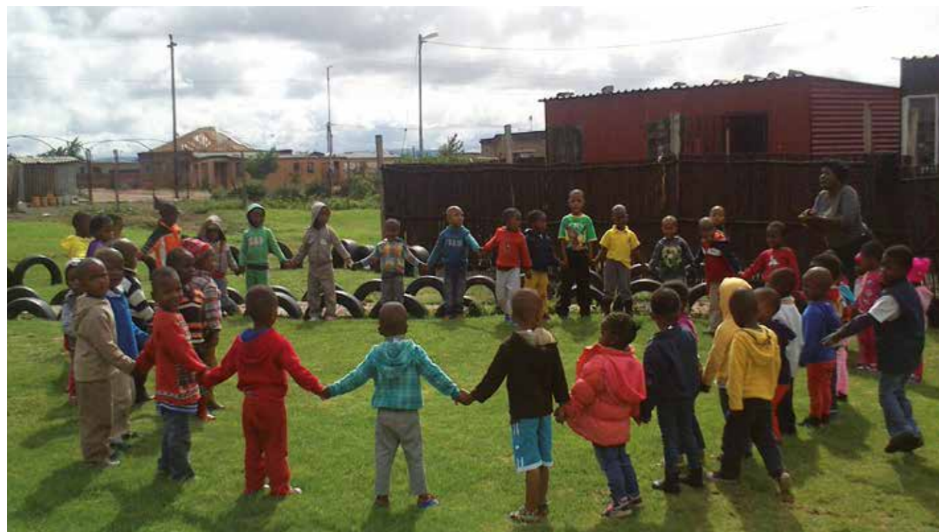
The present daycare facility currently cares for 72 children and consists of minimally-furnished corrugated iron huts with holes in the roof and walls, poor insulation, and broken windows.