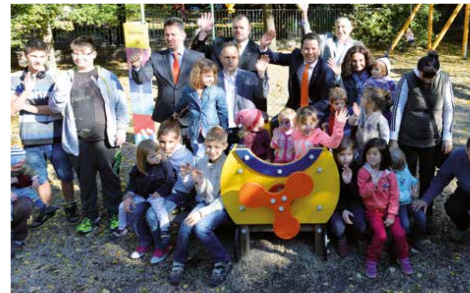
Children and parents enjoyed the inaugural ceremony for the newly renovated playground of the Hungarian Maltese Charity Service in the Óbuda district of Budapest.