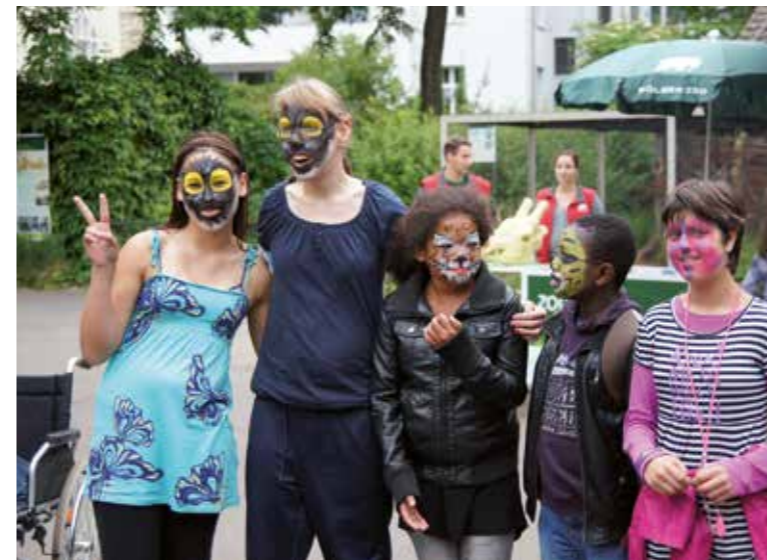
The children are the center of everything – VIPs at the Cologne zoo for the evening.

After visiting the bear sanctuary the group went to Bran Castle, where the children learned about the city's history, its importance in the region, and its use as a royal residence. The adventurous day ended for the children back in Bucharest, exhausted but overjoyed.