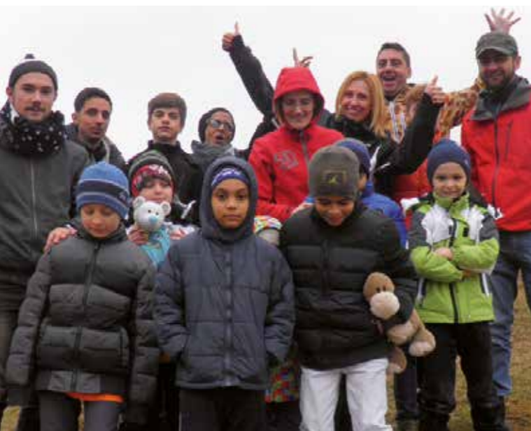
The trip was supported by Caritas Bucharest and included a visit to Libearty Bear Sanctuary near the town of Zarnesti, which is home to more than 70 European brown bears.